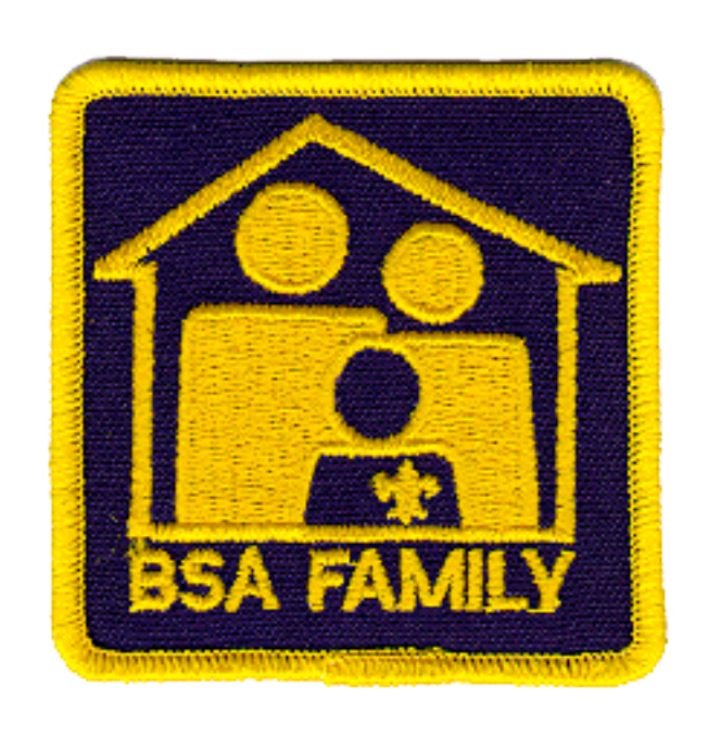
Participant Guide Cub Family Camping Weekend April 12-14, 2013 (rev. 3/1/13)