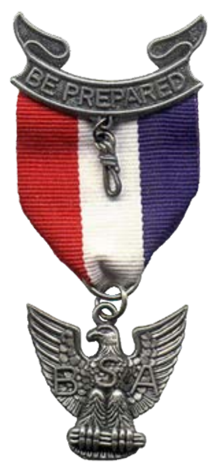
*https://en.wikipedia.org/wiki/List_of_Eagle_Scouts ^https:// www.scouting.org/About/Research/EagleScouts.aspx