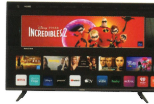
40" SMARTCAST TV