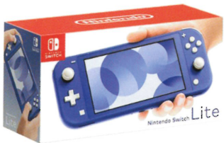
NINTENDO SWITCH LITE