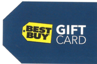
$200 BEST BUY GIFT CARD