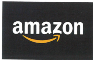
$200 AMAZON GIFT CARD

PICK A PRIZE FROM THE WINNER'S CIRCLE FOR EVERY $2,500 SOLD