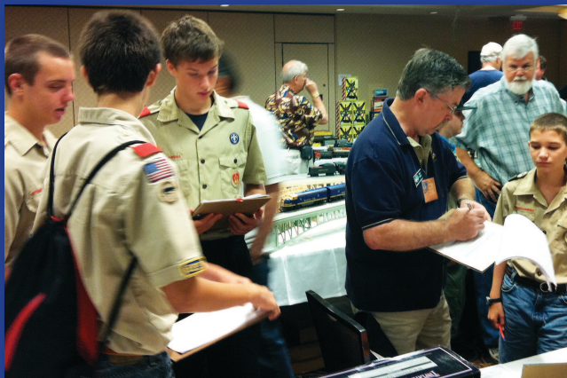
Many scouts attending the BSA Railroading Merit Badge Clinic during the LCCA 2011 Convention in Dallas, TX, qualified for this important merit badge.

Prepare for your Railroading Merit Badge