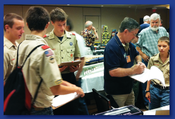
Many scouts attending the BSA Railroading Merit Badge Clinic during the LCCA 2011 Convention in Dallas, TX, qualified for this important merit badge.

BSA Clinic Held during the LCCA Convention at the Marriott Waterside Hotel Norfolk, VA Saturday, July 28, 2012, 8:30 to 2