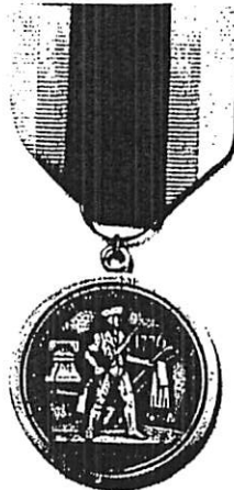
Chapter Winner Medal